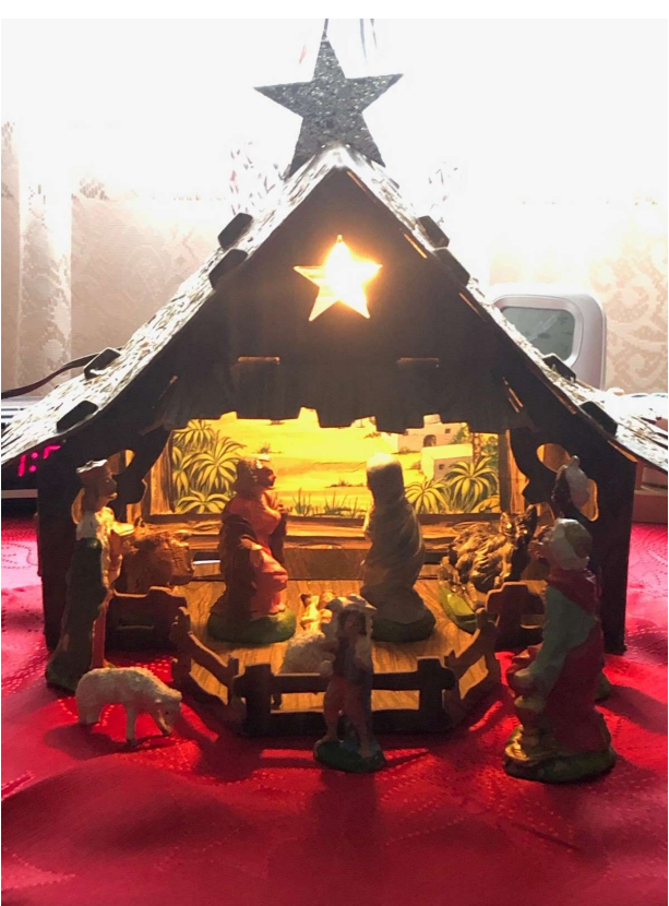
Anne & Val's Unlit and Lighted with beautiful shadow effect.