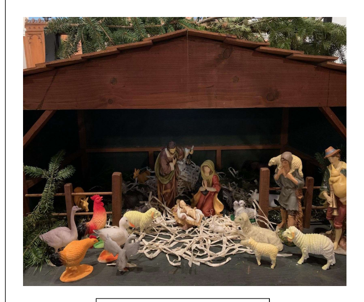
St. John's Church